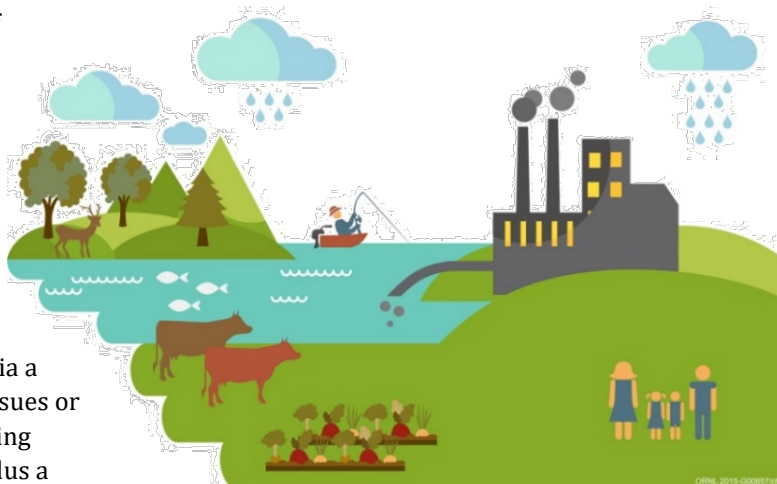
Figure E.2. Examples of radiation pathways

People can be exposed to radionuclides in the environment through a number of routes, as shown in Figure E.2. Potential routes for internal and external exposure are referred to as pathways. For example, radionuclides in air could be inhaled directly or could fall on grass in a pasture. If the grass were then consumed by cows, it would be possible for the radionuclides to impact the cow's milk, and subsequently the people drinking the milk. Similarly, radionuclides in water could be ingested by fish, and fishermen or other consumers could then ingest the radionuclides in the fish tissue. People swimming in the water also would be exposed. Exposure to ionizing radiation varies significantly with